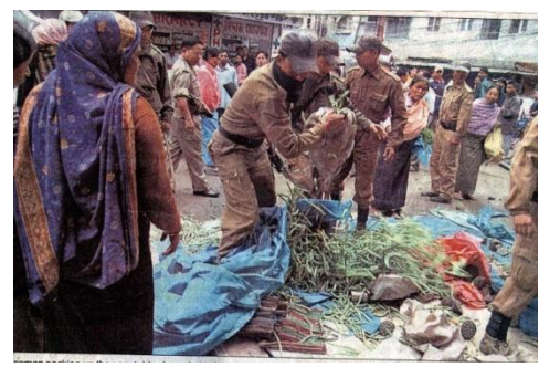
Photo-1: Policeman packing-up the vegetables brought by the street side vendors for sale in the bazar.