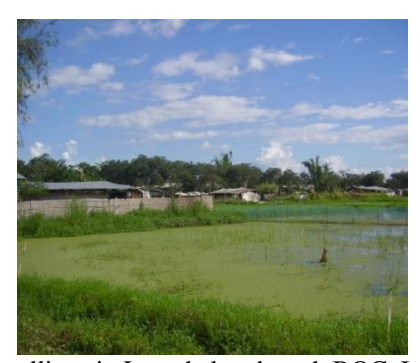
Photo-2: Squatter settlements and makeshift dwellings in Lamphel and north BOC, Imphal

Table-4: Distribution of Urban Households and Number of Rooms Occupied in Manipur, 2001