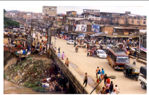
Solid waste garbage poured into the Nambul river.